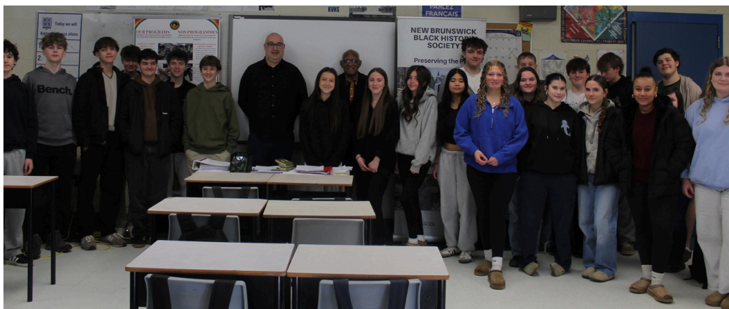
Black History Month in-school presentations