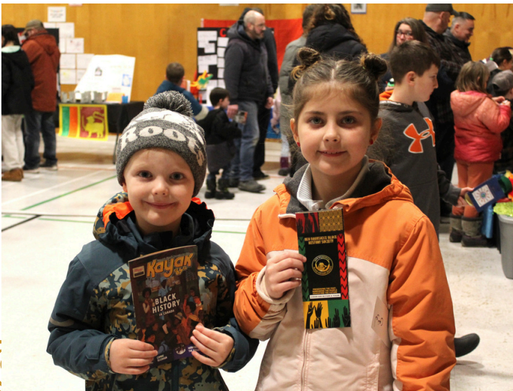
Educating the future through in-school presentations and engagement