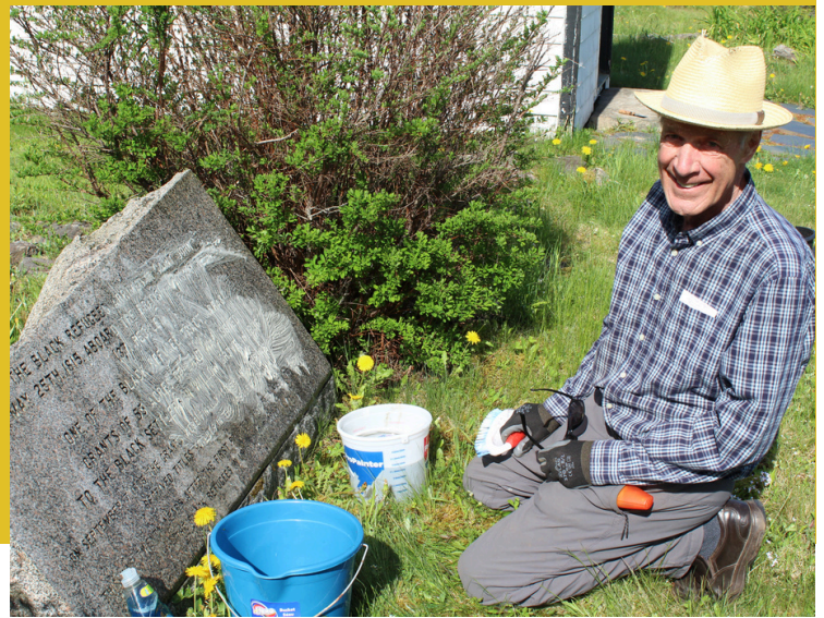
Honoring and preserving our legacy - Willow Grove Spring Clean up