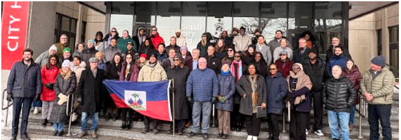
Flagraising Ceremony to kick start Black History Month 2026 - 2 nd February 2026