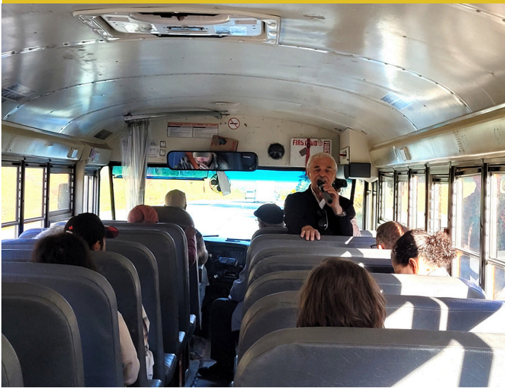
Bringing history to life through guided Bus Tours to various sites of Black History significance

Researching, preserving, sharing, and connecting New Brunswick's Black history to the world.