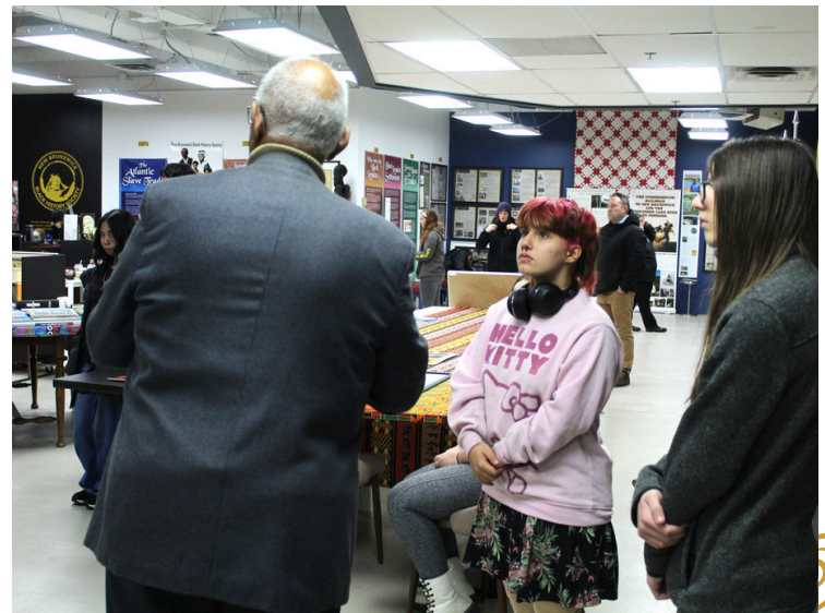
Connecting black history to the world through guided tours of NBBHS Heritage Centre